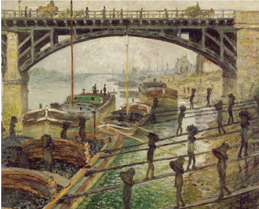
Figure 2 Claude Monet, Unloading Coal , c. 1875. Musée d'Orsay.

bridge. The bridge is visibly a “higher” level of existence, one dominated by commodities and artificially lit. The figures are no more distinct or individualized up there, even though some are at rest or watching the underlings carry coal, so you would rather be one of them. The two spaces of phantasmagoria—production and consumption—are linked into one visualized system here. It is given coherence by the overall warm tone of the painting, that subdued yellow hue, which is the product of coal smoke. The degradation of the air is seen as natural, right, and hence aesthetic, a key step in any visibility: it produces an anaesthetic to the actual physical conditions. The Anthropocene is so built in to our senses that it determines our perceptions, hence it is aesthetic. Just as with Impression a few years earlier, Unloading Coal is constructed from an unusual midair viewpoint, interpreted by Richard Thomson (2010: 123) as being the view from the window of a train as it crossed over the river Seine between Argenteuil and Paris. If we take this literally mapped view, Monet turned the moving image seen from his train, often taken to be the precursor of cinema, into a still. This freeze-frame